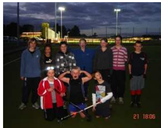
The first group to go through the defenders clinic

The last two Friday evenings have seen large groups of enthusiastic children at the Clareville Hockey Complex participating in specialist clinics. On Friday the 14 th there was a striker's clinic for any junior player wanting to learn some of the skills needed to become a quality striker or forward and last Friday (the 21 st ) there was a defenders clinic for juniors wanting to improve their tackling, channeling, and passing among other things. Both clinics went well and due to high demand, there will be more of them run within the next month. A U-11 defenders clinic is being run on Tuesday the 25 th too.