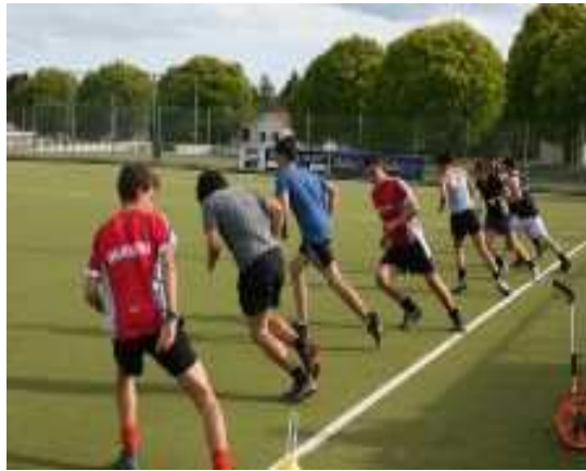
The Player Pathways group undertaking a beep test during their first session.